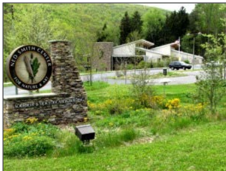
The Ned Smith Center for Nature and Art