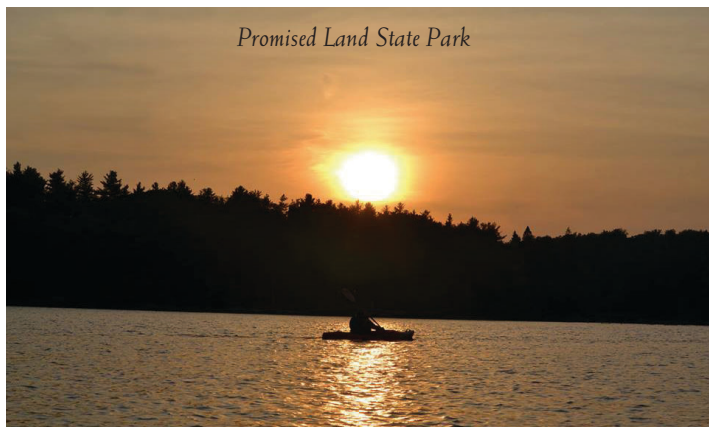
Promised Land State Park