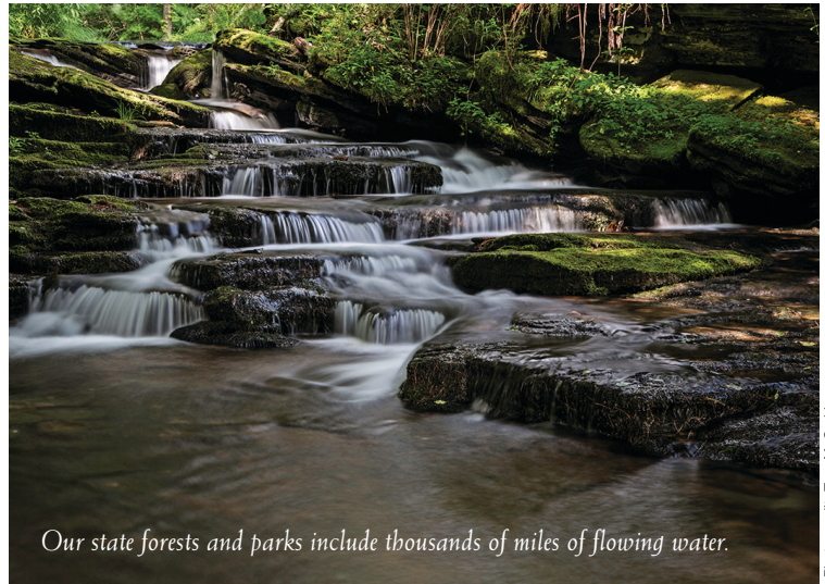
Our state forests and parks include thousands of miles of flowing water.