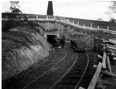
Early 20th century coal mining

It wasn't always easy, but through decades of hard work, environmental stewardship and quality management, Pennsylvania is a shining example of how valuable protected land can be. In fact, many now view our state parks and forests as essential features for healthy ecosystems and critical wildlife habitats, the protection of water resources, outdoor education and recreation, personal well-being, and overall health.