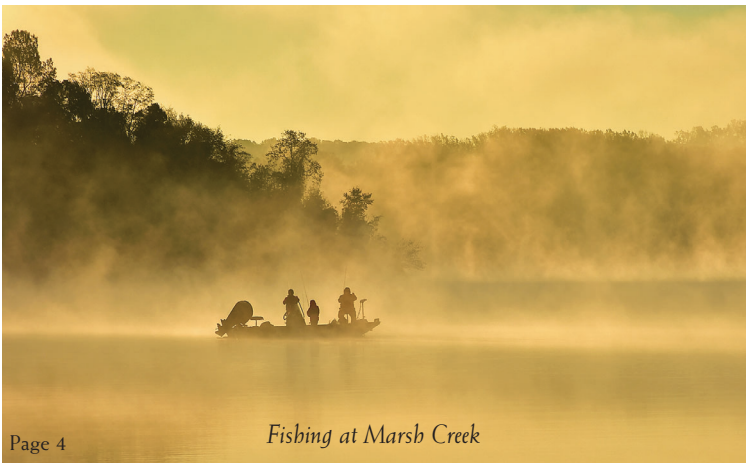
Fishing at Marsh Creek